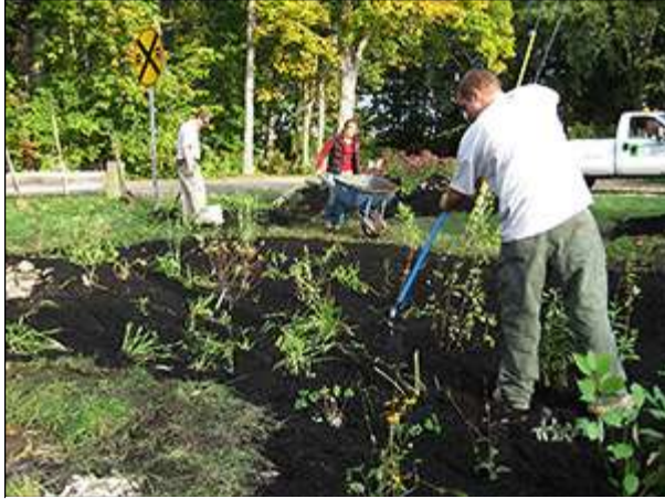
A rain garden is installed in the New Hampshire seacoast.