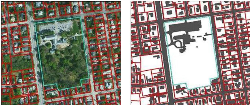
Imagery and parcel data is used to create impervious surface maps, which are used to establish the rate methodology and fee structure.