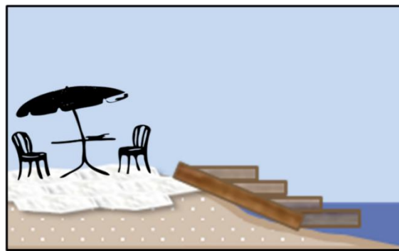
Figure 3 - Access stairs to and from water access structures, viewed as a cross-section.

Stairs made of wood or wood-like materials that are constructed over the existing grade and are removed at the end of the season are the preferred design for access to and from the water, as they typically are the best option to avoid and minimize impacts surface waters and resources (Figure 3). Stairs constructed to and from water access structures must not exceed 6 feet in width, from edge to edge (i.e., maximum total width). If these stairs are installed or constructed to provide access to the water, they must be removed from the lakebed prior to ice-in and not be re-installed until ice-out.