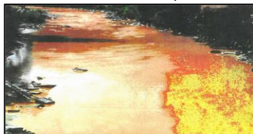
Mill discharge coloring a local river ©1960

supporting tourism and recreational opportunities, enhancing economic and residential development, and helping create a prosperous and thriving environment with sustainable water resources.