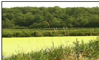
Algae bloom - unnamed water body ©197

For decades preceding the Clean Water Act (CWA), discharges of untreated and poorly treated wastewater into Central New Hampshire Lakes and Rivers resulted in "pea soup" conditions and fish kills in Lake Winnepesaukee, Lake Winnisquam, and the Tioga and Winnepesaukee Rivers. The WRBP was created in the 1970s as part of CWA efforts to construct wastewater infrastructure and eliminate these discharges. This program preserves water quality in the Lakes and Rivers of Central New Hampshire,