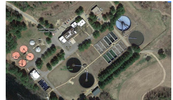
Franklin Wastewater Treatment Plant

The state-owned collection system and wastewater treatment facility serving 10 Lakes Region communities